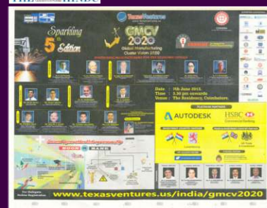
Half page Advertisement in The Hindu