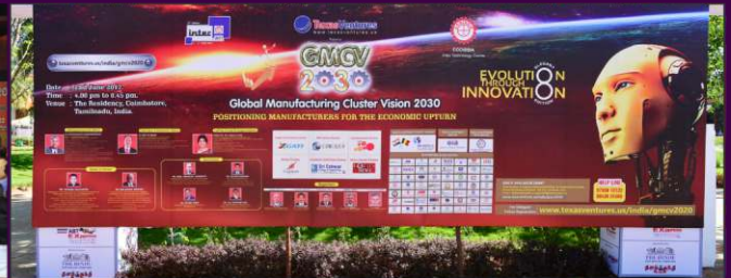
Hoarding @ the entrance of the INTEC Exhibition Venue