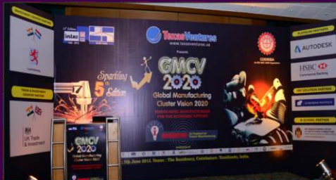
GMCV 2030 - Conference Backdrop