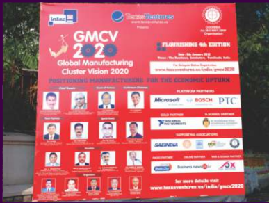
Hoarding @ the entrance of the Conference Venue