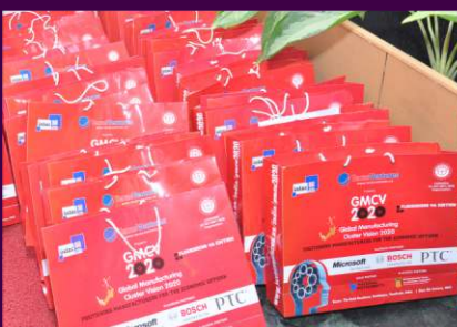
GMCV2030 Delegate Kit