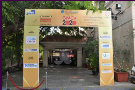
Arch at the Entrance of the Conference Venue