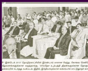
Event Coverage in News Papers