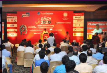
GMCV 2030 - Main Stage